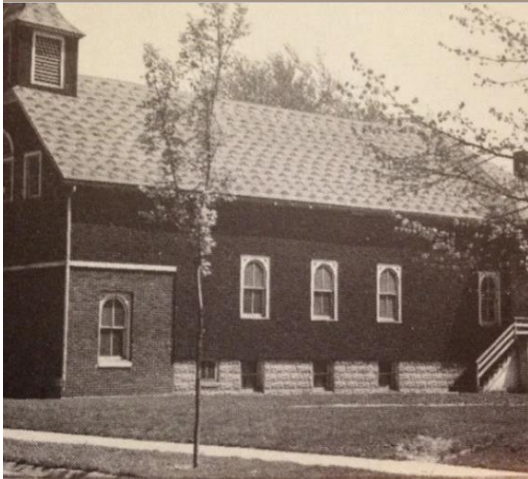
Soorp Haroutune church before the fire of 1960 after which our current church was built.